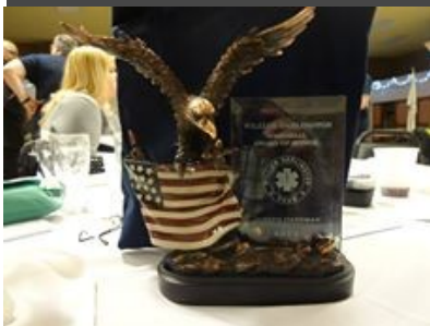
William Garlington Memorial Award