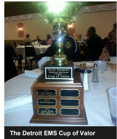
The Detroit EMS Cup of Valor