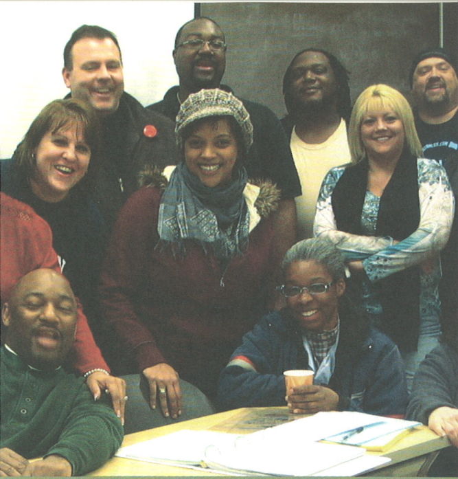
Labor Studies Center