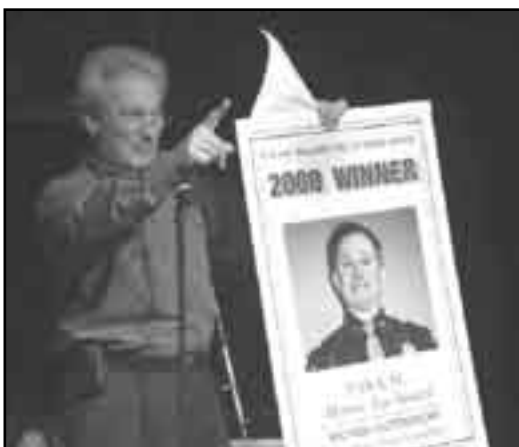
You're outta here!