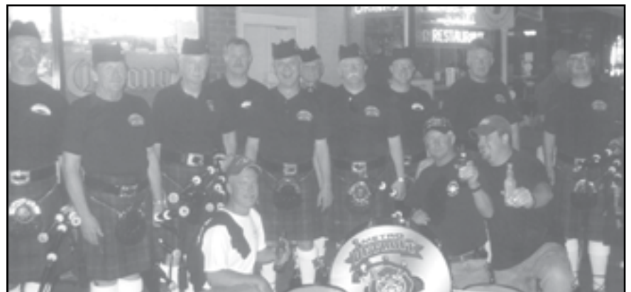
Detroit Police and Fire Pipe and Drum Corps.