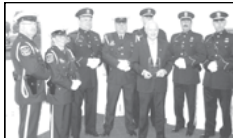
Congressman Joe Knollenberg with Livonia and Southfield Honor Guard.