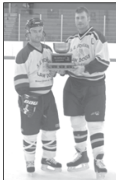
Staving off stiff competition from the likes of the Michigan State Police and the Kent County Sheriff Department, the Southeast Michigan Law Dogs hoisted another Copper Cup at the annual spring tournament held in the Grand Rapids area.