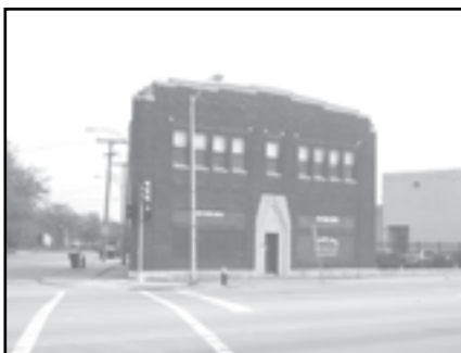
The Weyhing Bros. building is a landmark on Gratiot Ave.