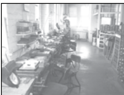
All original work stations are still functional.